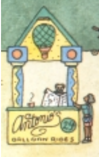
View from Ground Level