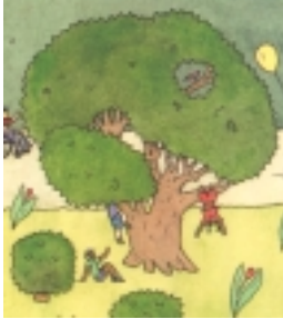
View from Ground Level

Things don't look the same when you look down on them as they do when you look straight at them.